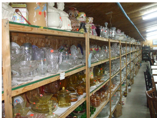
Some of the numerous pieces of tightly packed antique glass on display.